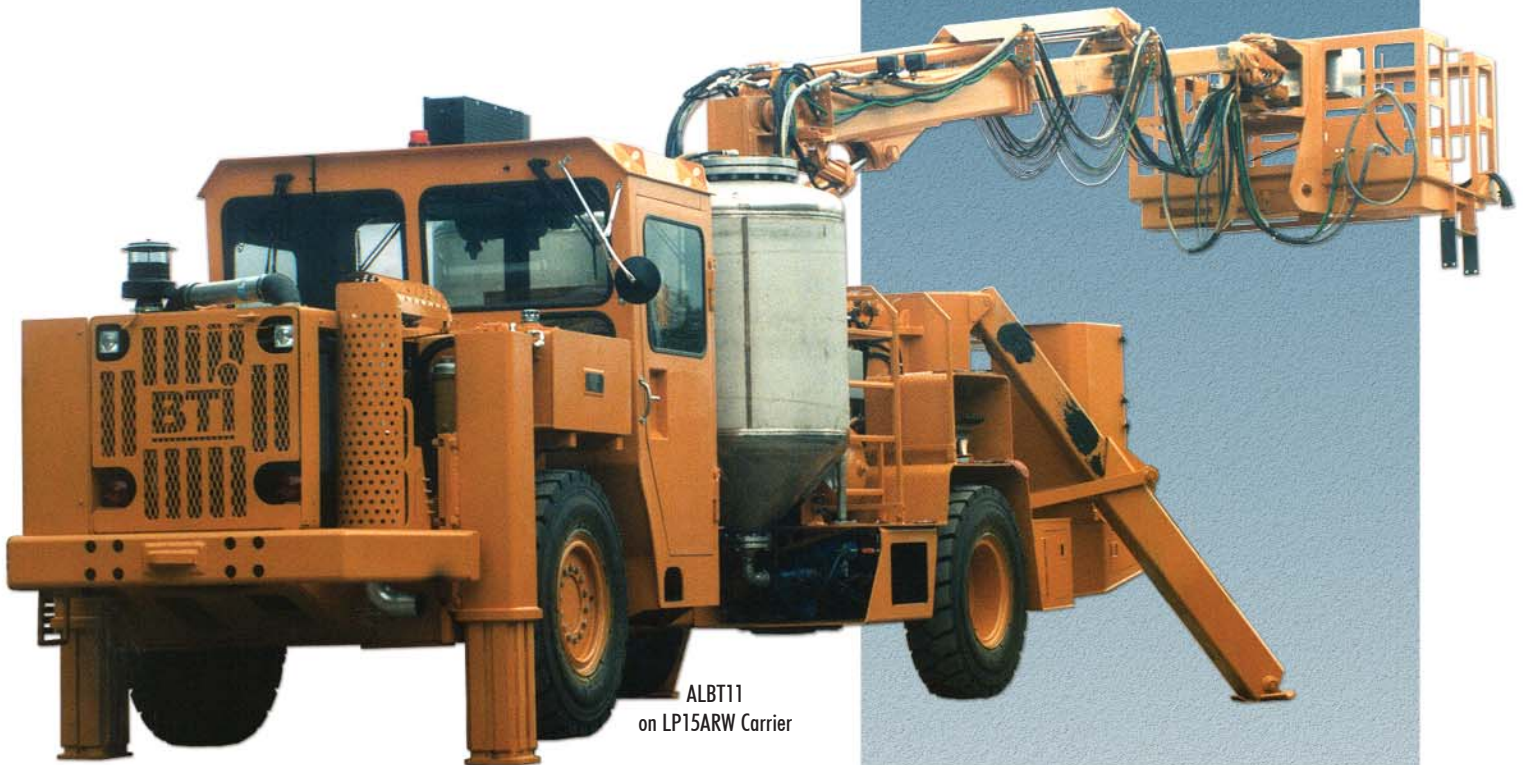
ALBT11 on LP15ARW Carrier

Easily allows up to 270 degrees of boom rotation for single, double or triple face coverage